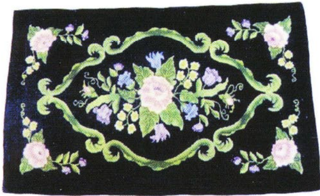
“duBarry” Hooked by Kay Colepaugh Page 67