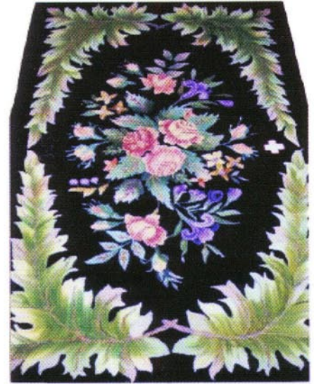
“Aunt Eva’s Gift” Hooked by Shirley Engel Page 53